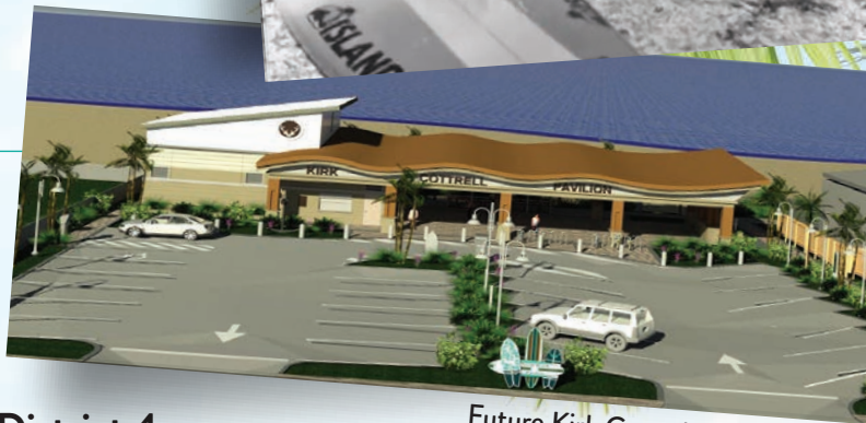
Future Kirk Cottrell Pavilion